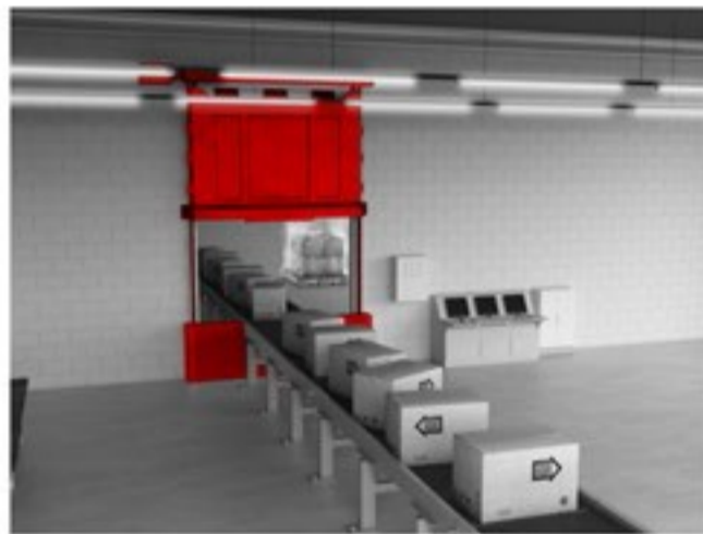
Conveyor System Closures